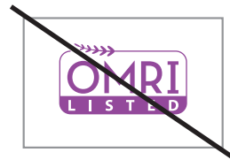
Do not change the Seal color.