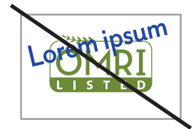
Do not type over the Seal.