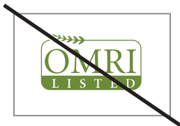
Do not change the Seal font.